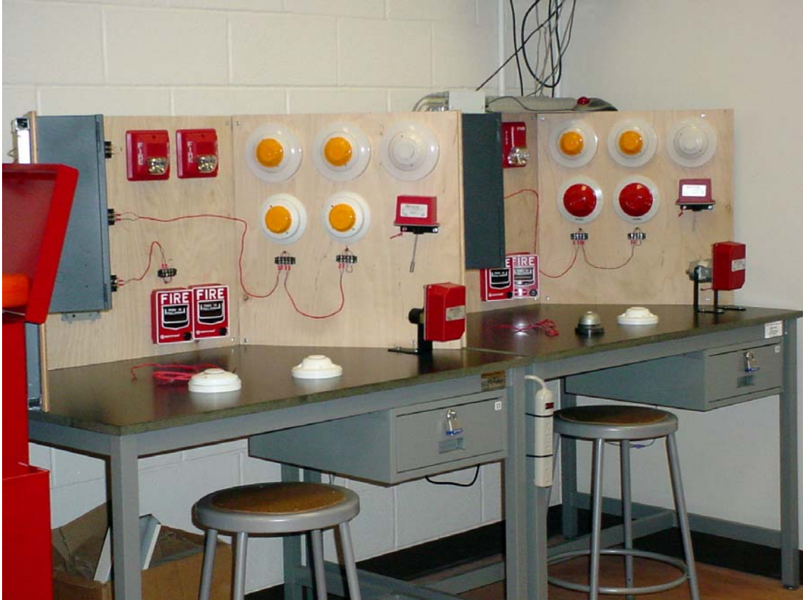
Two of the Fourteen Fire Alarm Workstations in the Fire Alarms Laboratory. These are Notifier Addressable Fire Alarm Panels with Control, Zone and Monitor Modules, Conventional and Addressable Initiating Devices and Strobe Notification Appliance Circuits.