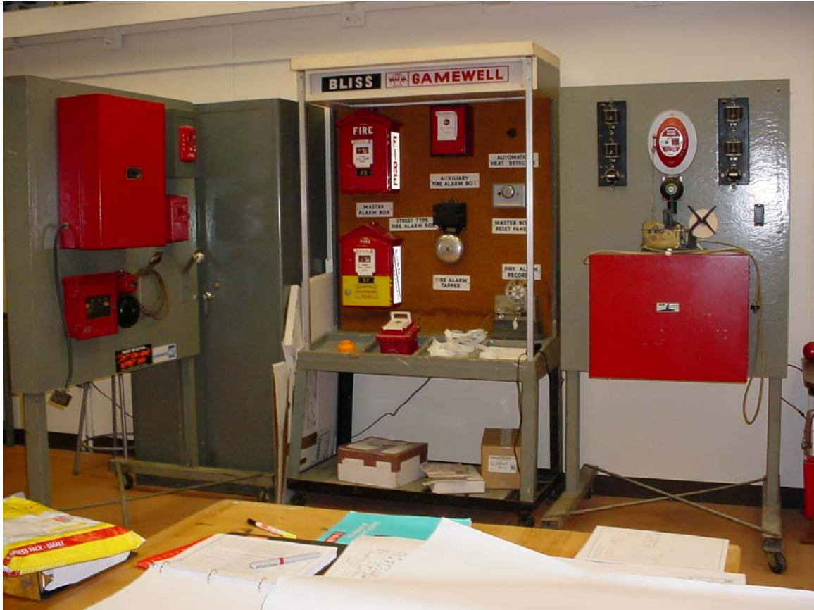
We do have a few antiques also.